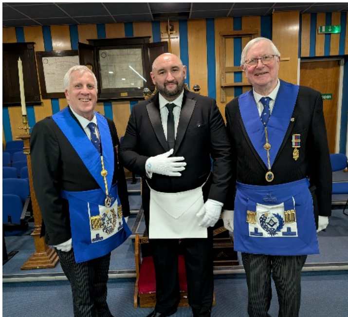
Gooch Lodge No.1295