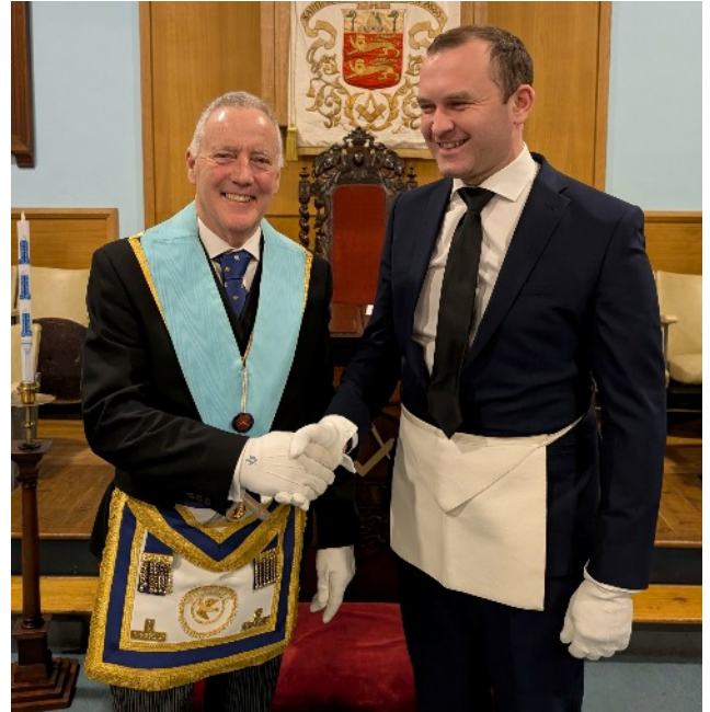
St Aldhelm Lodge No.2888