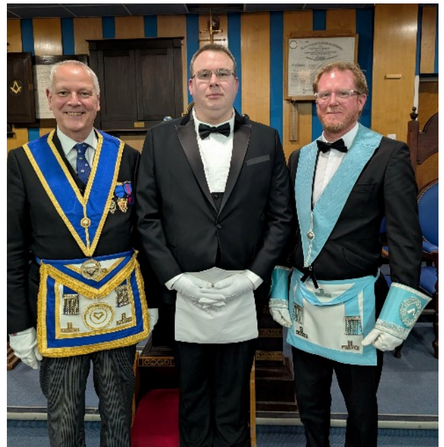
New Temple Lodge No.8435

Entered Apprentice, Fellowcraft or are you a Master Mason wanting to know more? Well, FINDING YOUR FEET could be the answer and we would love to see you in Swindon on Saturday 8th March