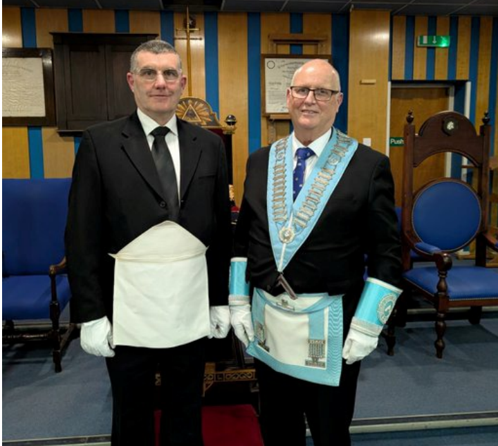
George Duke of Kent Lodge No.8788