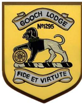
Gooch Lodge No. 1295