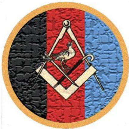
Lodge of Brothers In Arms No. 9540