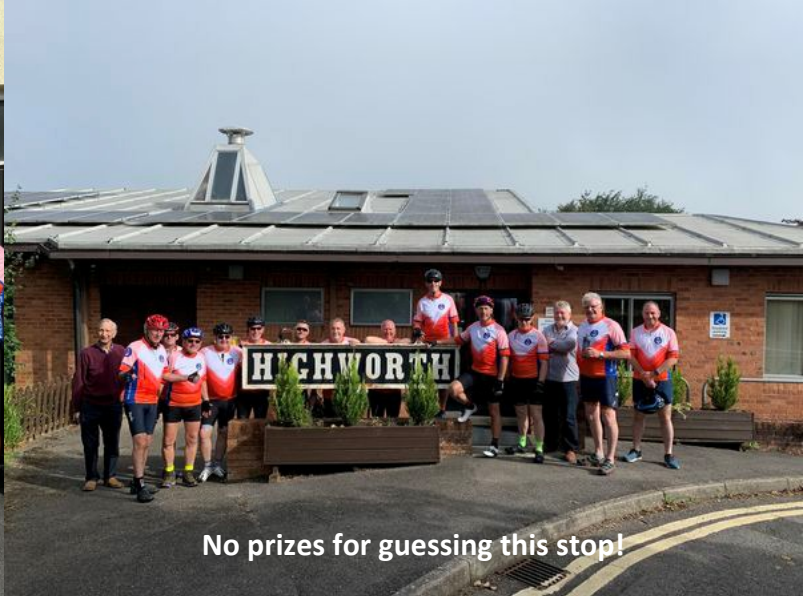
No prizes for guessing this stop!