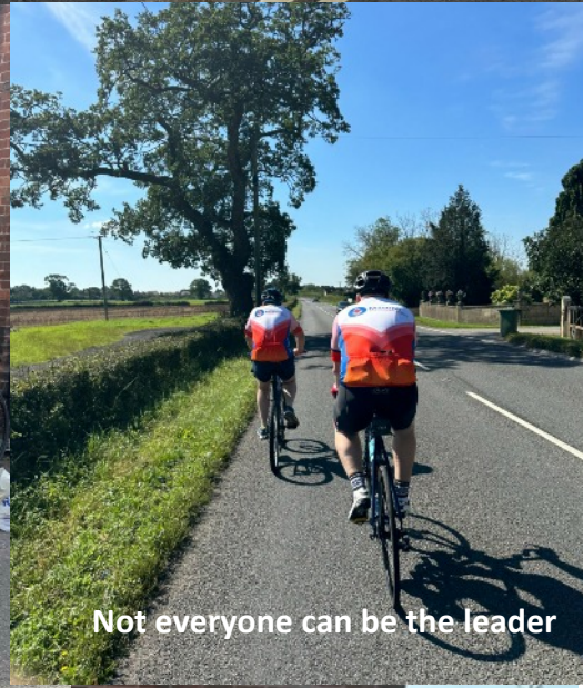
Not everyone can be the leader