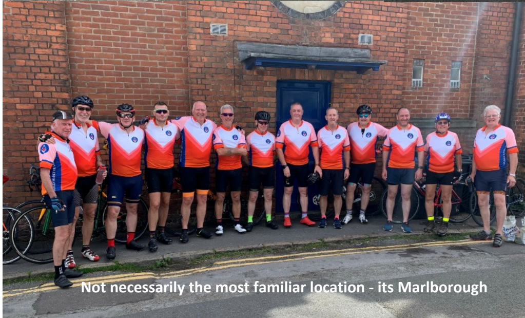
Not necessarily the most familiar location - its Marlborough