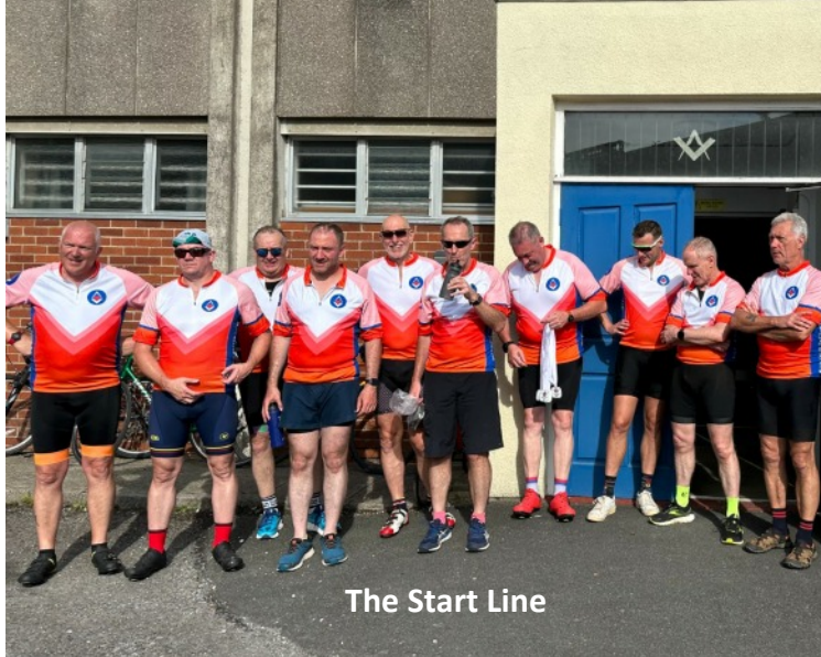
The Start Line