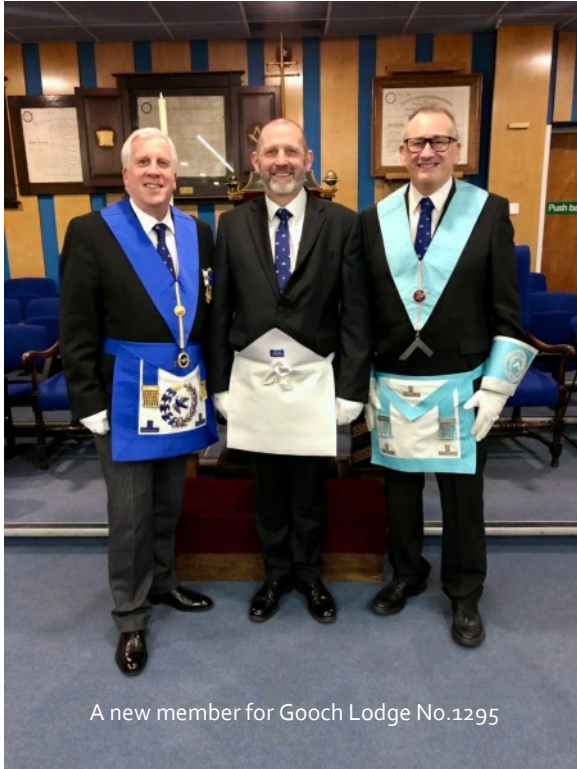
A new member for Gooch Lodge No.1295

Lots of activity in Swindon where nine Craft Lodges meet.