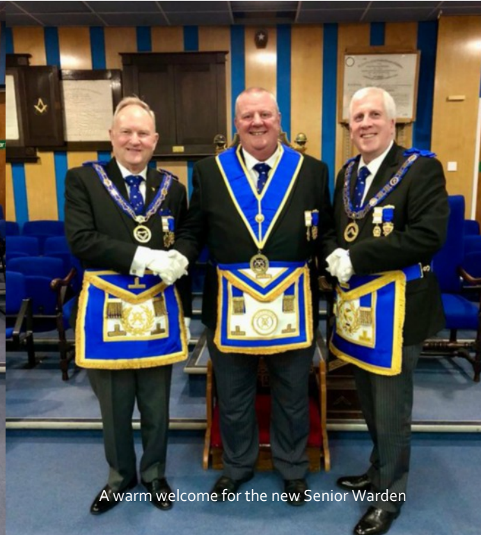
A warm welcome for the new Senior Warden