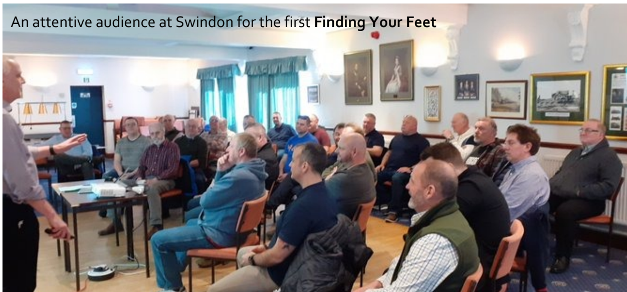
An attentive audience at Swindon for the first Finding Your Feet

The first of the Learning & Development Team's 2022 programme of events was attended by over 30 Brethren in Swindon on Saturday 19 th March. The second event, for Brethren preparing to hold office as a Deacon, was also held in Swindon on the following weekend.