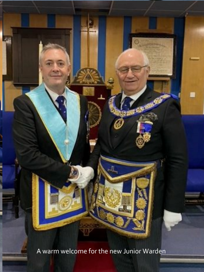
A warm welcome for the new Junior Warden