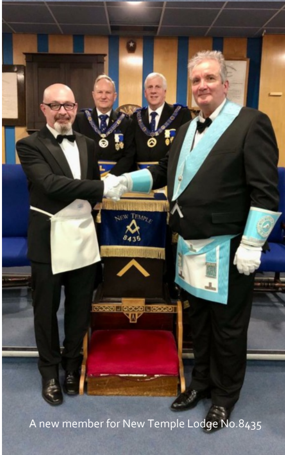
A new member for New Temple Lodge No.8435