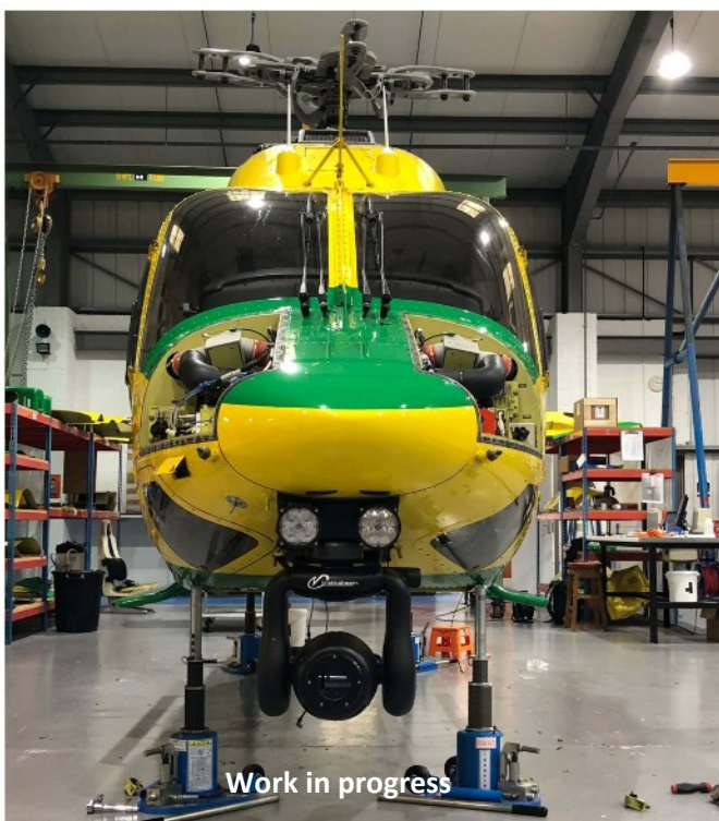
Work in progress

This year the Air Ambulance (a Bell 429 helicopter) has added some improvements to the helicopter's ADAHRS (air data, attitude and heading reference system).