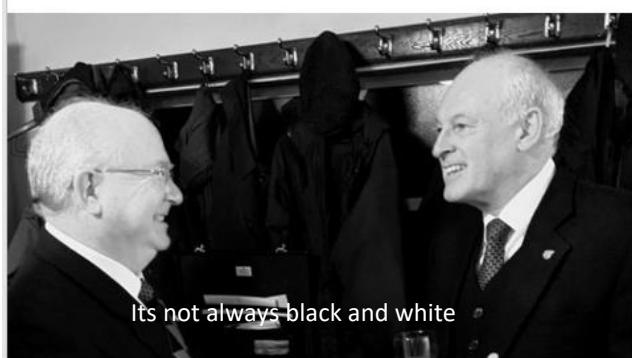
Its not always black and white