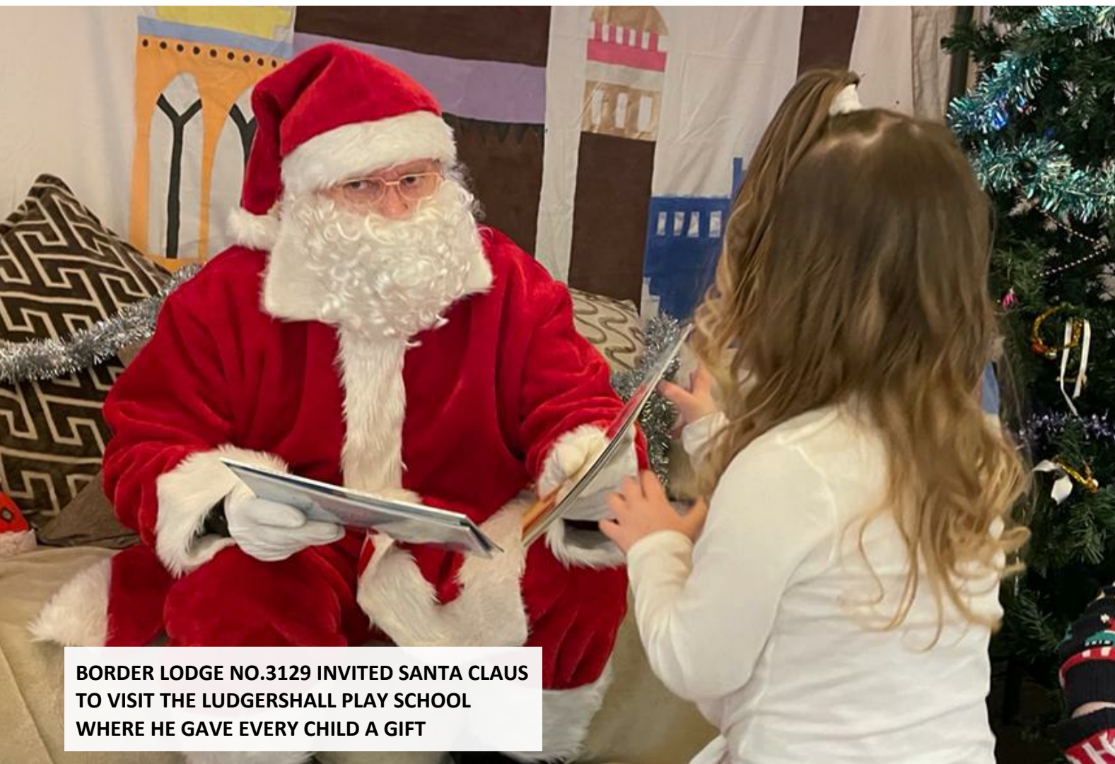
BORDER LODGE NO.3129 INVITED SANTA CLAUS TO VISIT THE LUDGERSHALL PLAY SCHOOL WHERE HE GAVE EVERY CHILD A GIFT

As we fast approach 2022 (do you remember the Millenium?) I wish you a very merry Christmas, and a happy and healthy New Year. I look forward to seeing you and sharing some Masonic cheer.