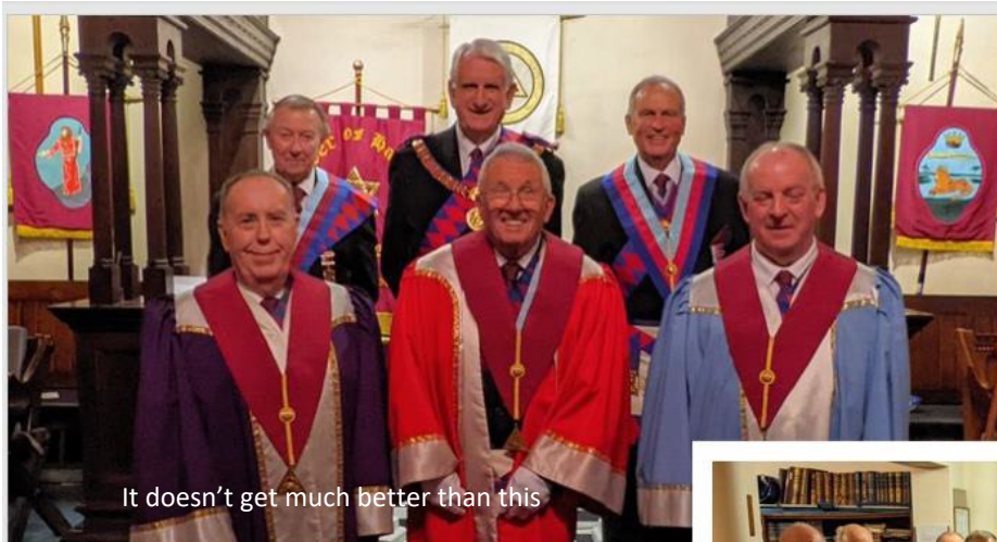
It doesn't get much better than this

I wish you all a very happy Christmas. And a healthy and prosperous New Year.