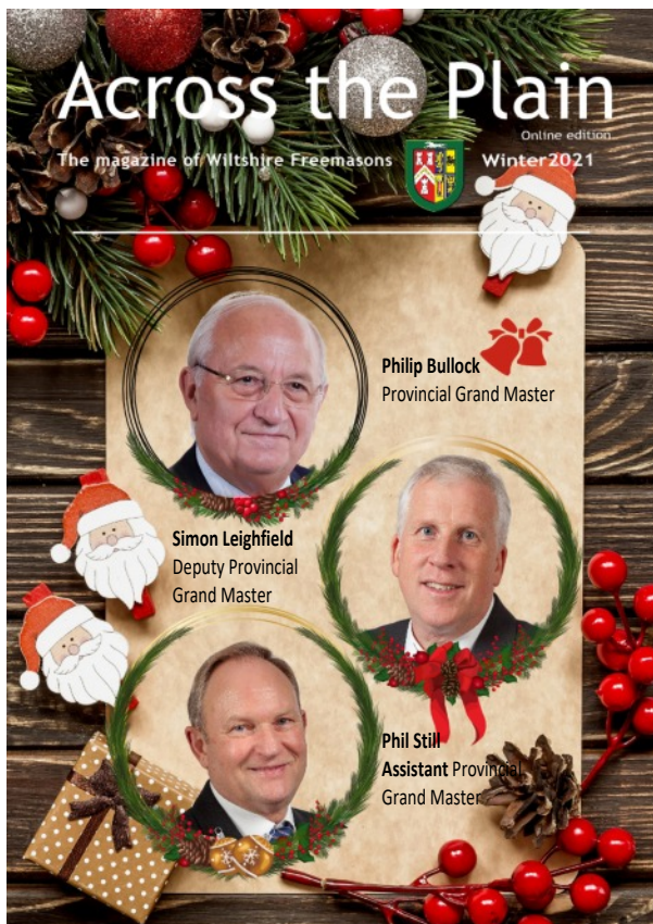
This month's cover features three wise men otherwise known as the Provincial executive wishing all our readers a very Happy Christmas.