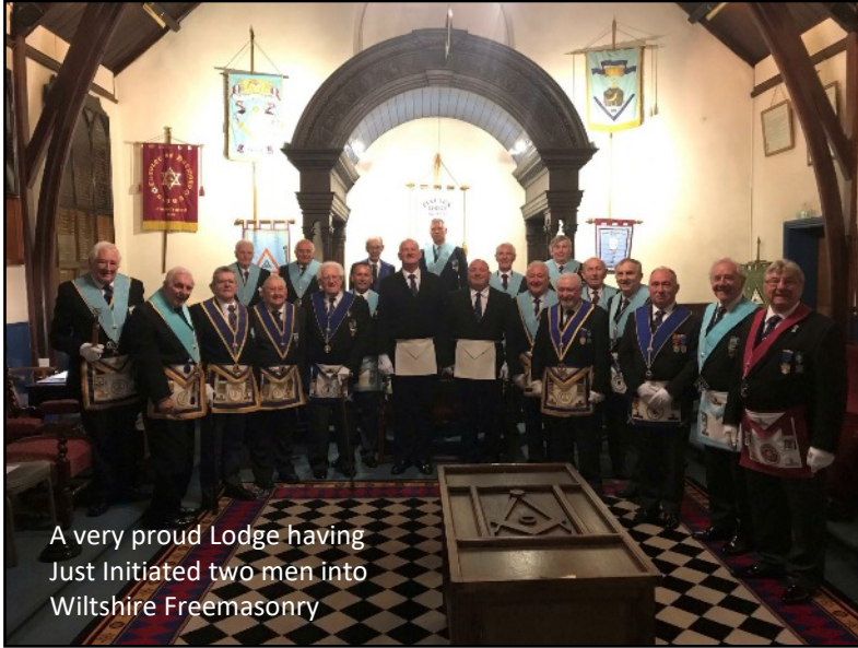
A very proud Lodge having Just Initiated two men into Wiltshire Freemasonry

Fiat Lux translates into 'Let There Be Light' which is a great name for one of Wiltshire's daylight Lodges which meets in the market town of Devizes. The Lodge is only seventeen years old and largely consists of joining members.