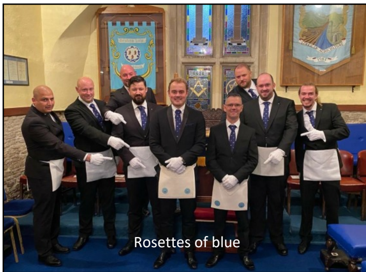
Rosettes of blue