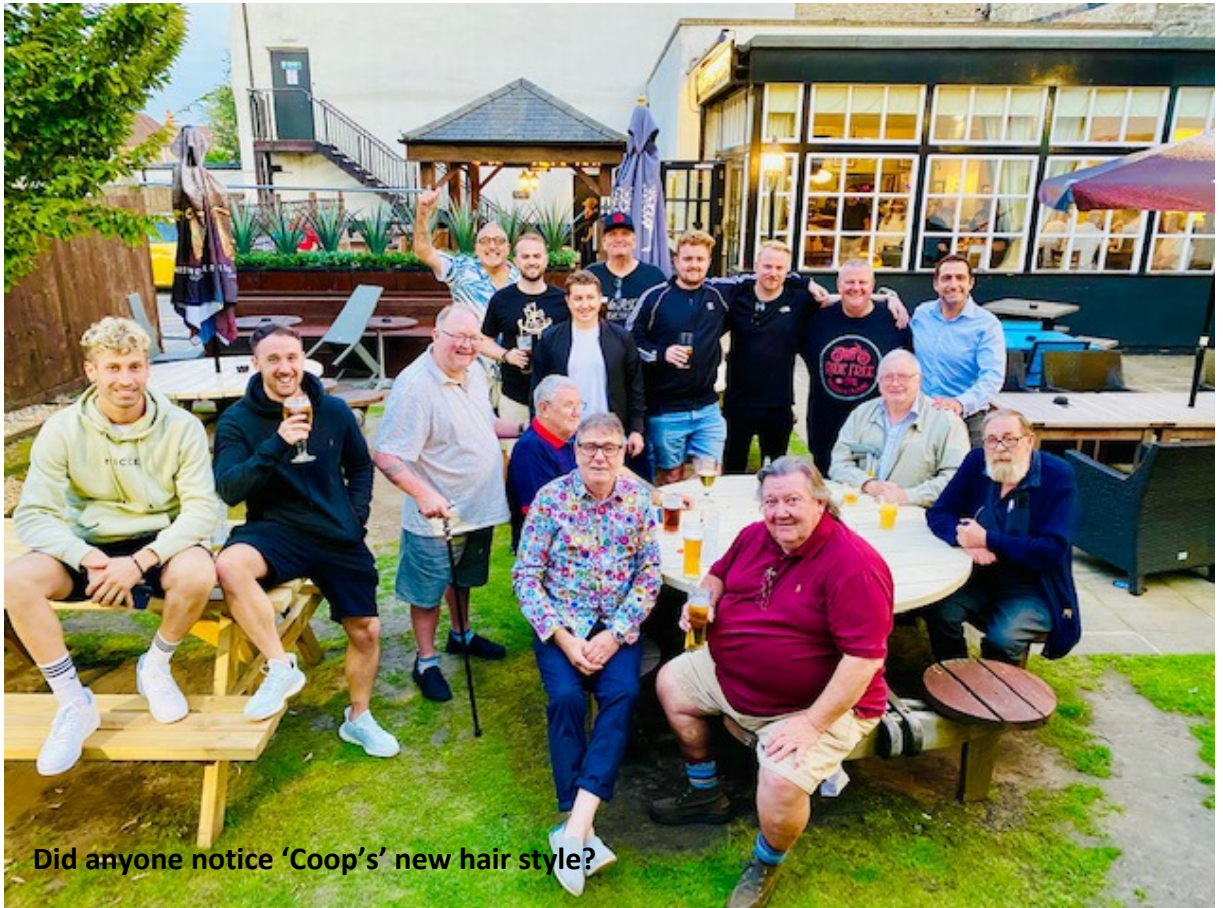
Did anyone notice 'Coop's' new hair style?

The Brethren of New Temple Lodge No.8435 have really missed each other during the Covid-19 crisis so they got together to celebrate their return to Freemasonry - it looks as if they made up for lost time as they enjoyed the opportunity to socialise mask free.