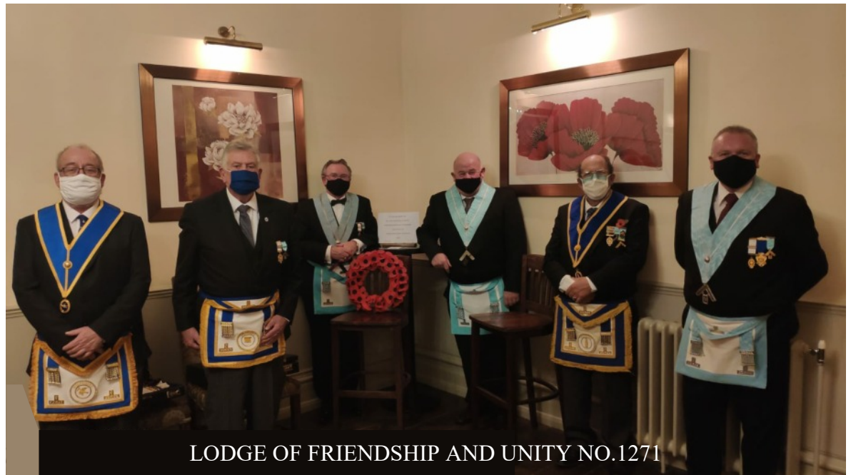
LODGE OF FRIENDSHIP AND UNITY NO.1271