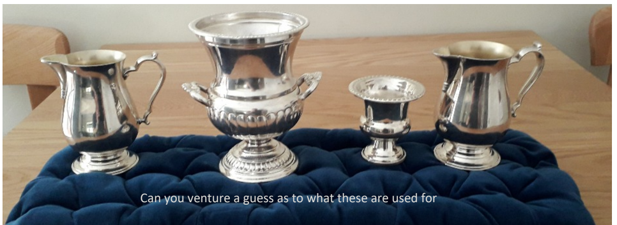
Can you venture a guess as to what these are used for