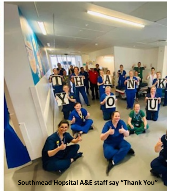
Southmead Hopsital A&E staff say "Thank You"