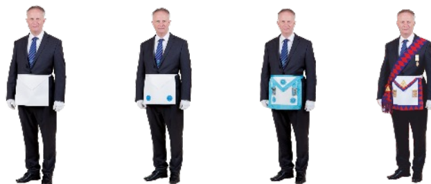
Step 1. Entered Apprentice Step 2. Fellowcraft Step 3. Master Mason Step 4. Companion