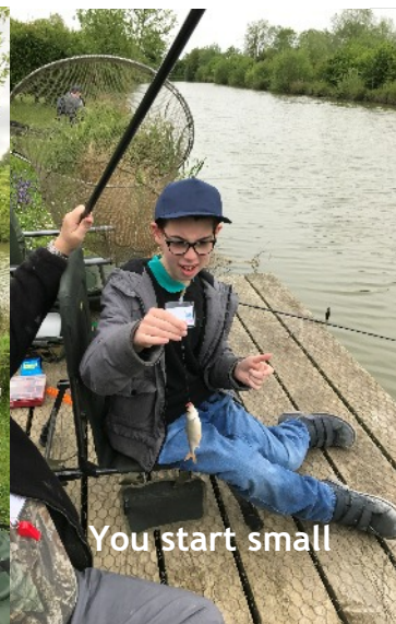
You start small