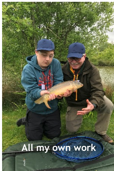
All my own work