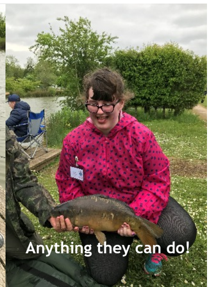
Anything they can do!